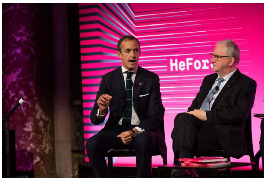
Sciences Po Director at HeforShe 10X10 Impact champions conference, NYC, 2017