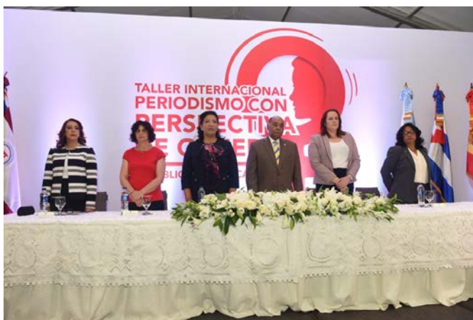
Inauguration of the Seminar in Santo Domingo (Dominican Republic)