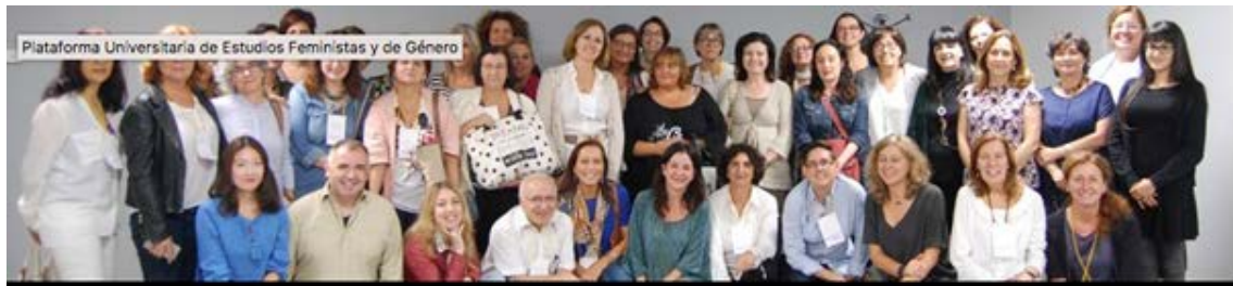
The members of the Platform at their first meeting.