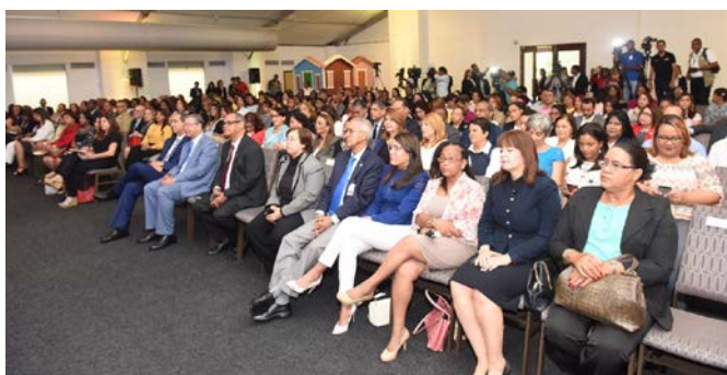
Participants in the Seminar on the Gender Perspective in Journalism. Sto Domingo, July 2017