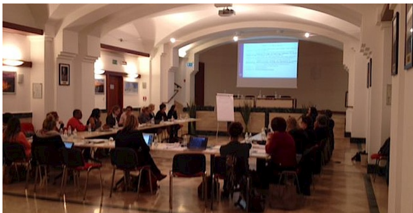
Participation to an experience workshop held under TRIGGER