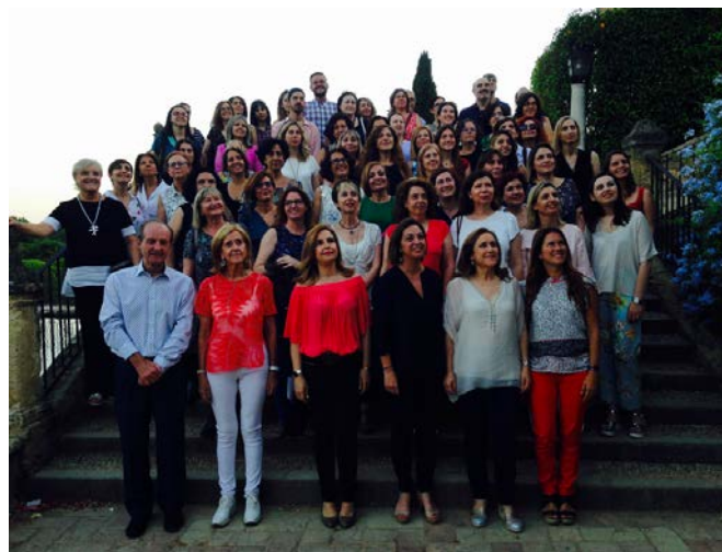
Participants at the Meeting of Gender Equality Offices in Spanish Universities