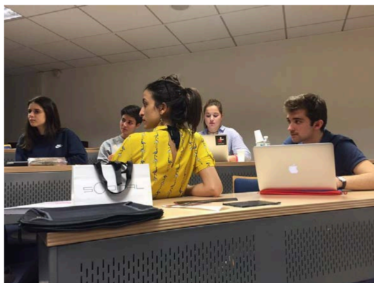
Sciences Po HeforShe Ideathon on fighting gender stereotypes and gender-based violence, 2017

Home page of the policy lab for Sciences Po students devoted to the next level of gender equality policies