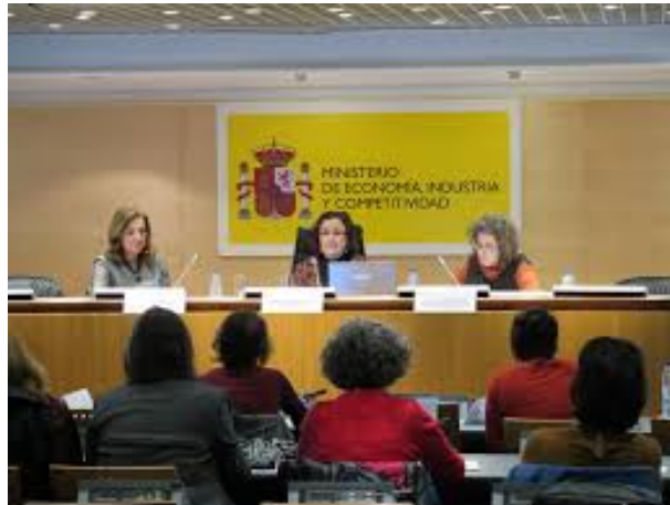
Presentation of the network of EU-project for gender equality in science at MINECO, Madrid