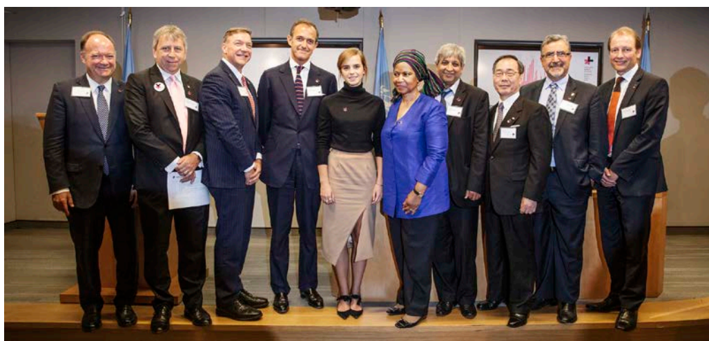
Sciences Po Director with Emma Watson and 9 other University gender equality champions at MoMA, NYC